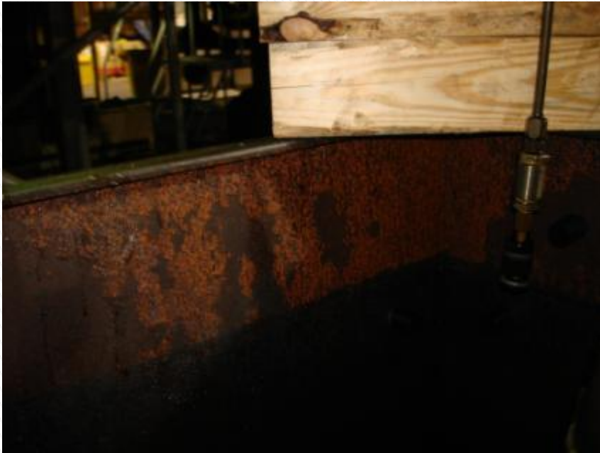
Side Wall Rust