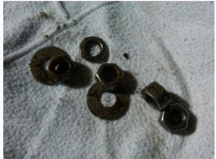
Found in Press Section Return Sump