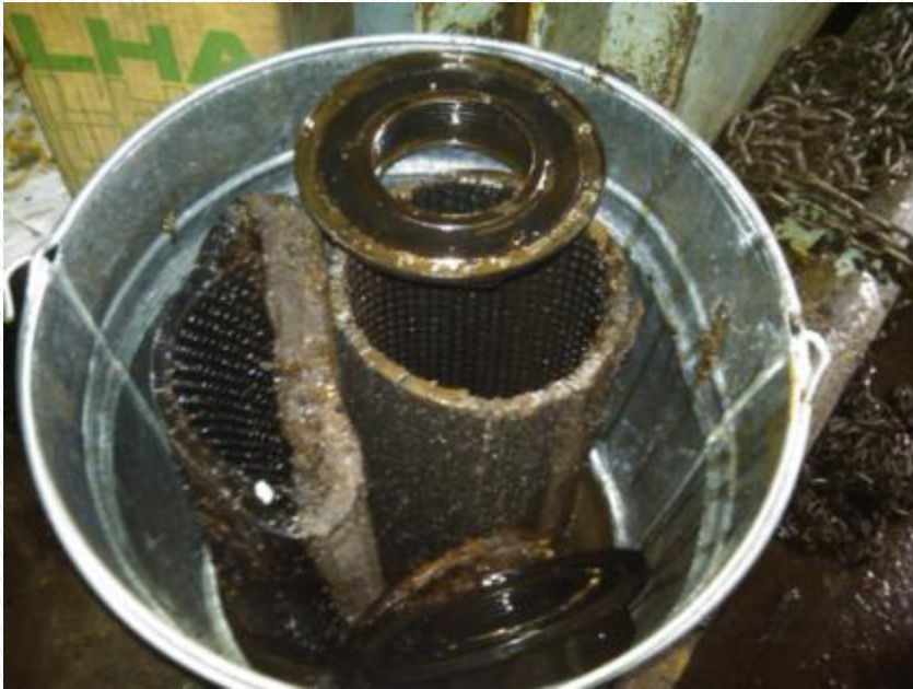
Pump Suction Filters on Bottom of Drive Side Return Sump