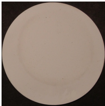
MPC Value: 8