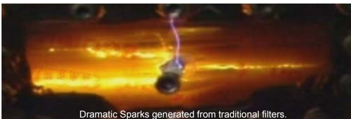
Dramatic Sparks generated from traditional filters.